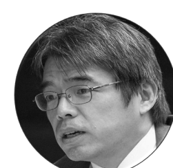
Eisaku Toda , Secretariat of the Minamata Convention