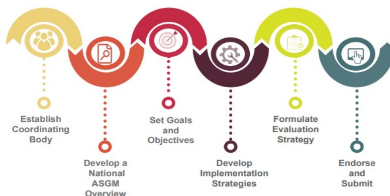
Figure 1. Recommended steps in the process of developing a National Action Plan (source: NAP Guidance)

When establishing the NDWG and/or SAG, governments should aim to set criterion for representation of Indigenous Peoples and local communities engaged in or affected by ASGM and the use of mercury. 10 Examples of where these representatives could come from include Indigenous Peoples and local communities ASGM associations through representatives chosen by themselves in accordance with their own procedures and decision-making institutions, and local civil society organizations. It is important that Indigenous Peoples and local communities consider the representatives as legitimately having a position on these governing bodies and that there is acceptance of traditional governance and decision-making structures. Where Indigenous Peoples are living in voluntary isolation and are impacted by mercury, they can be represented by a mandated Indigenous Peoples organizations or government agency working outside of these communities. Representation of Indigenous Peoples and local communities by these groups needs to be documented (e.g. Terms of Reference) and include their roles and responsibilities related to communications with consultation facilitation teams and consultation results, reporting and monitoring.